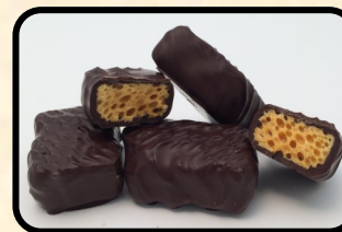
Dark Chocolate Covered Sponge Toffee