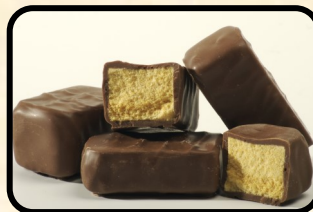
Milk Chocolate Covered Sponge Toffee