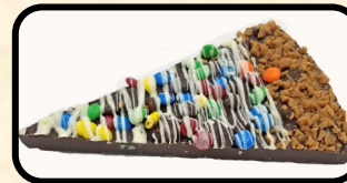
Dark Choc. M&M