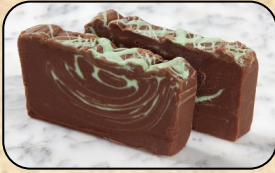
CHOCOLATE MINT SWIRL