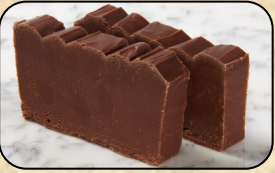
CHOC. PEANUT BUTTER