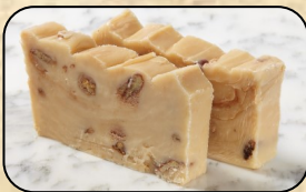
PRALINES & CREAM